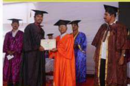
Convocation Ceremony 2019