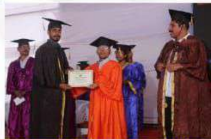
Convocation Ceremony 2019

An Industrial Visit was organized for V Semester students by the department on 9th october 2019 at All India Radio Panaji, Goa.