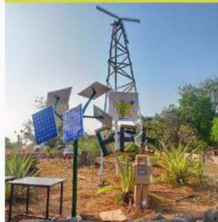
Techfest Aavishkar 2019